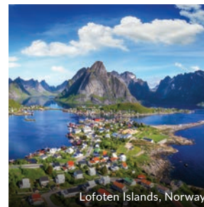
Lofoten Islands, Norway

Contact our agency to book your expedition cruise today.